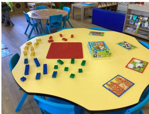
Tables for games and activities