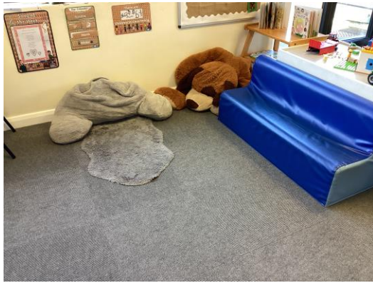
Carpet area for circle time

We have lots of different areas in our classroom for learning and play.