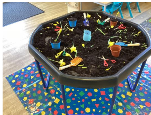
Tuff tray for exploring