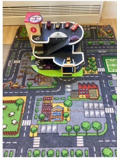
Car mat and garage