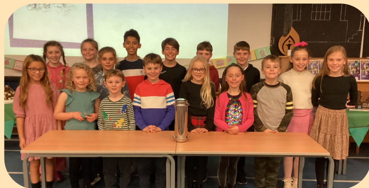
The School Council show off the Time Capsule