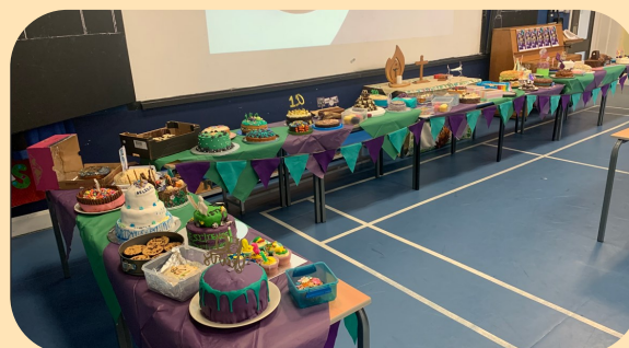
Cakes as far as the eye can see!