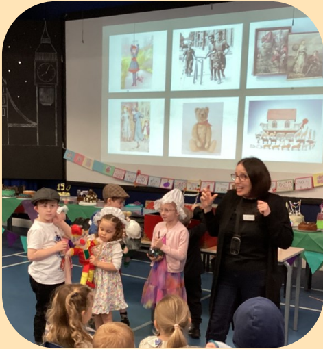
The Infants were enthralled by the Victorian toys..

We then took the opportunity of our school birthday to party, party, party—singing celebration songs, making bunting and birthday cards and—of course—who could forget the Great Birthday Bake Off? We were overwhelmed by the amazing response and can't thank everyone enough for using their baking skills to help us celebrate this most special of birthdays.