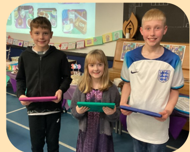
The Happy Winners