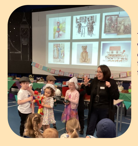
The Infants were enthralled by the Victorian toys..

We then took the opportunity of our school birthday to party, party—singing celebration songs, making bunting and birthday cards and—of course—who could forget the Great Birthday Bake Off? We were overwhelmed by the amazing response and can't thank everyone enough for using their baking skills to help us celebrate this most special of birthdays.