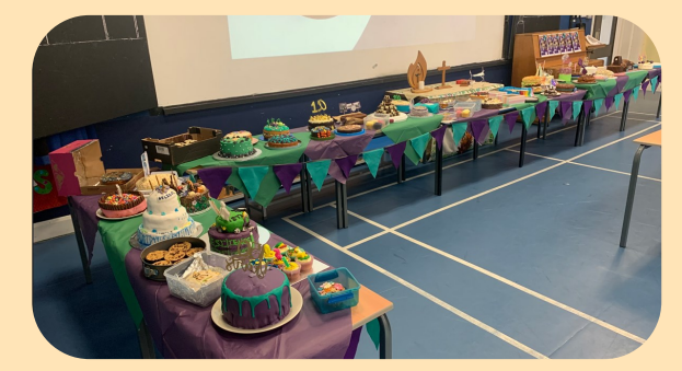
Cakes as far as the eye can see!